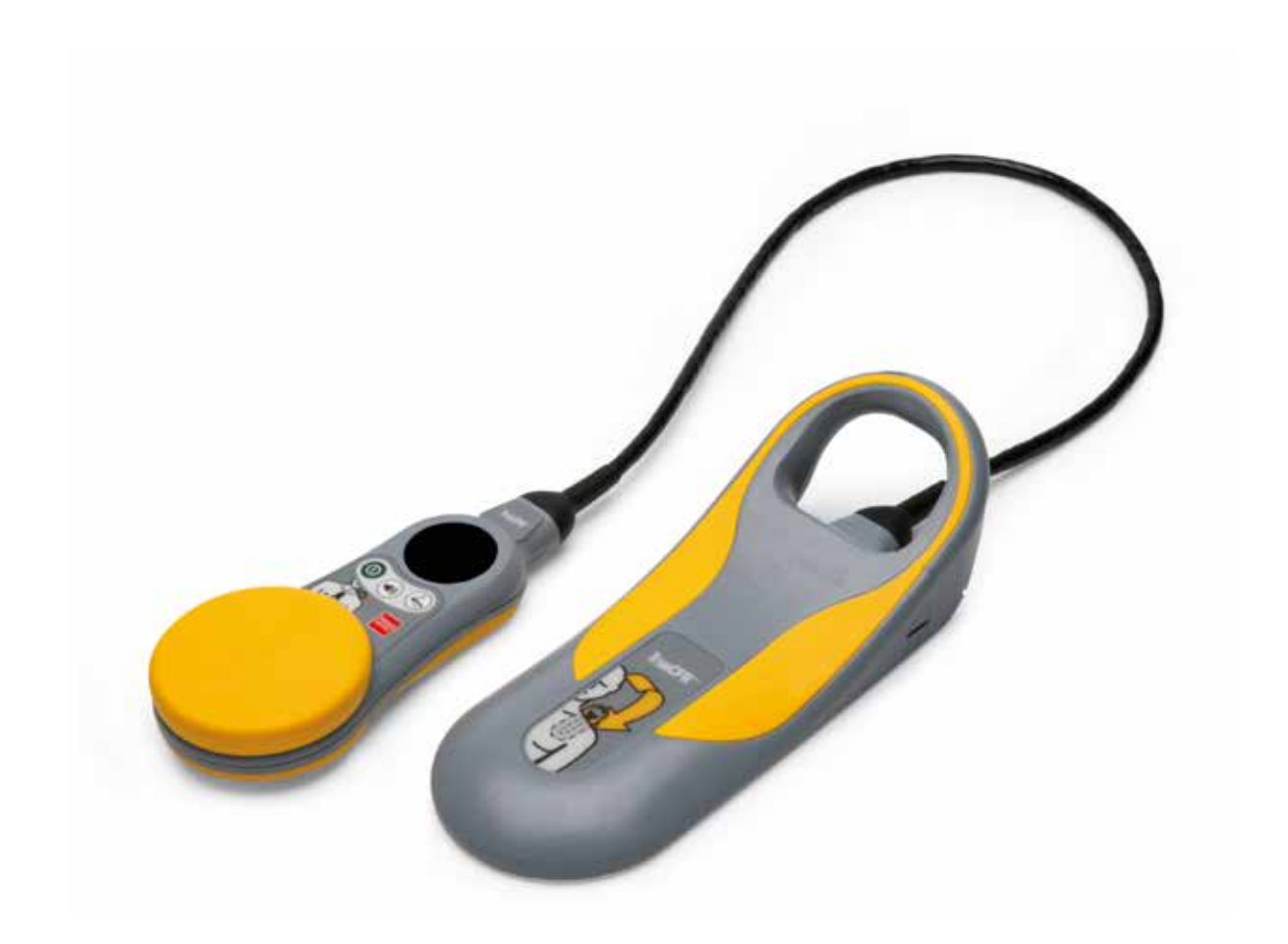
TrueCPR <sup>™</sup> coaching device